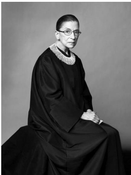
Figure 1: The Afanador Work, titled “Ruth Bader Ginsburg”