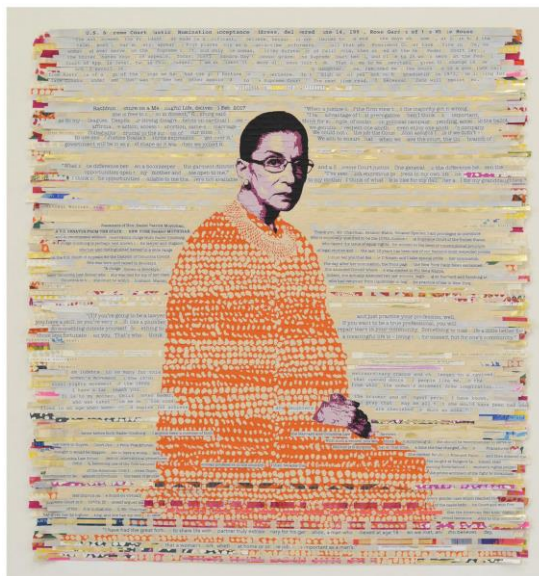
Figure 2: An example of the Torres Works, titled “A Judge Grows in Brooklyn”

Plaintiff asserts that it is the exclusive licensee of Afanador’s photographs, including the photograph at issue in this case. [Doc. 29, p. 7]. Plaintiff and Afanador entered into an agreement (the “Agreement”) on December 14, 2015. 2 [Doc. 29-6, p. 3]. Pursuant to the Agreement, Afanador retained Plaintiff as his